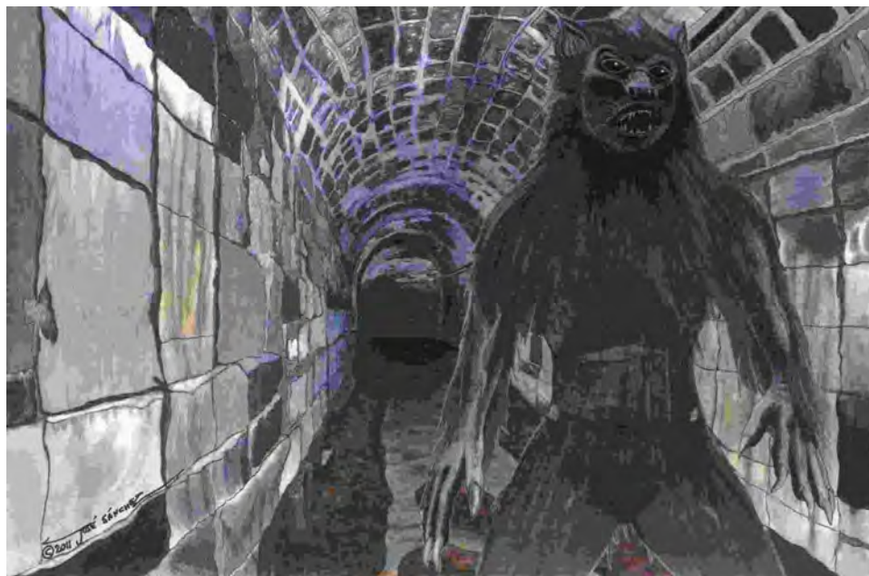
The Way Out