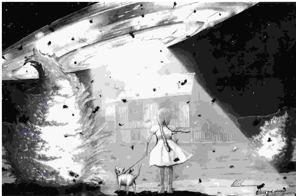
Out for a Stroll When All of a Sudden!