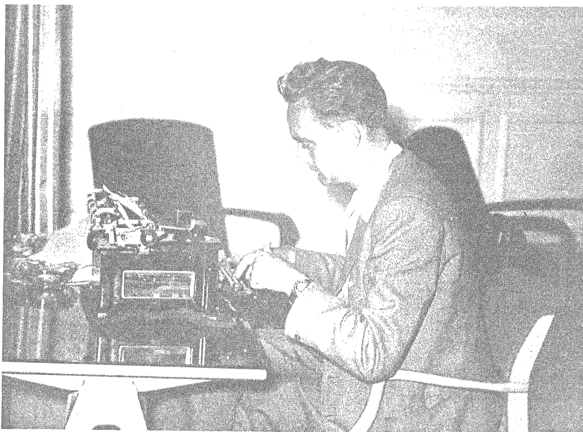
a fan at work