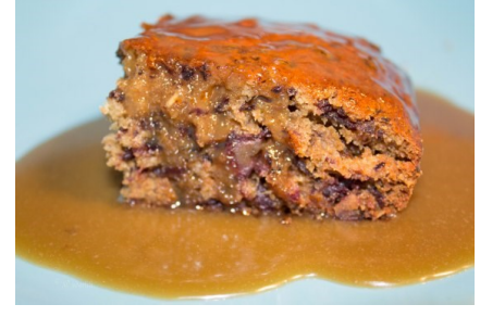
Sticky Date Pudding verdict: Let's do that AGAIN!