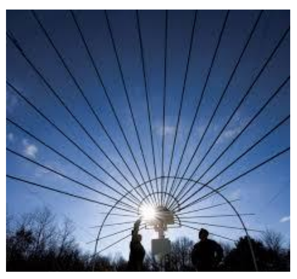
Fin de sieckle