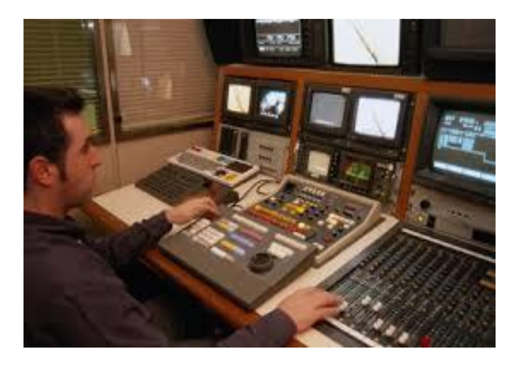
Have We Advanced?

Here it is, the new century, and we are well on our way into it. Nothing could be more emblematic of the future we thought about in the last century than a new century. In terms of literature and literary development, the twentieth century was the big century of science fiction, and in this new century our enthusiasm for this form of writing may be dying down. Can we keep pace with another century after all those earthshaking scientific discoveries have leveled out and those wars have been looked over for a hundred years, those world wars? As war goes, I believe we are now in a time of aftermath.