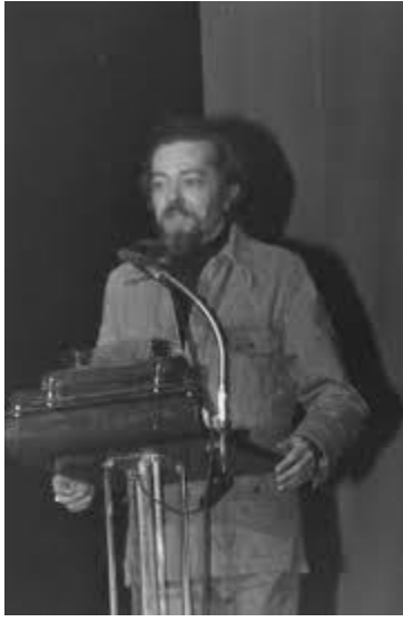
Lin Carter receiving the Grand Masters Award

SF personality Linwood Vrooman Carter began his fannish activities as a writer of LoCs to SF magazines. He became a professional author in 1957 with a story in F&SF , "Masters of the Metropolis" (written in collaboration with Randall Garrett). Carter's professional writing was mainly in the field of heroic fantasy, where he created the character of Thongor the Barbarian and collaborated with L. Sprague de Camp on the revival of Robert E. Howard's Conan the Barbarian. Carter was the force behind Ballantine's Adult Fantasy series (1969-1972); and, also beginning in the late 1960s, he edited more than a dozen SF/fantasy anthologies and collections.