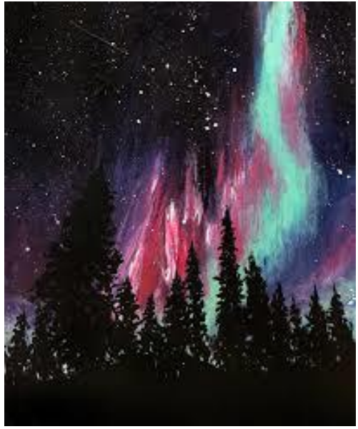
Northern Lights...an ionospheric phenomenon?