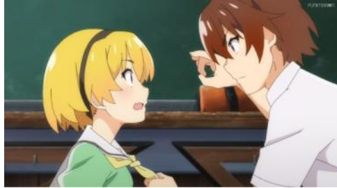
Keiichi and Satoko have an adversarial relationship.

However, it's these moments that feel somewhat less successful that the previous take on the story. There's a phenomenon that I mentally think of as the "Silent Hill effect", characteristics of that particular game series that occasionally spill over into other media. The first few Silent Hill video games (survival-horror games that appeared on the earlier Playstation consoles) were known for being disorienting and terrifying, while the later games in the series never managed to recapture the magic that made the originals so spooky. Part of the reason why, in my opinion, is that the first three or so games featured very uncomfortable controls that weren't as responsive as one might expect from a modern game. It was difficult to control your character and they sometimes didn't do what you wanted them to do – they ran out of stamina at inopportune times and occasionally missed their target when shooting or bludgeoning baddies. There was an