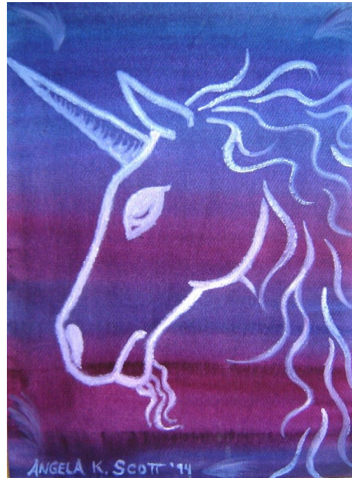
Unicorn Outlined — Angela K Scott

When the plague has run its course and conventions are back have small scale room parties. These were always good for promoting cons and other events. Usually providing non-