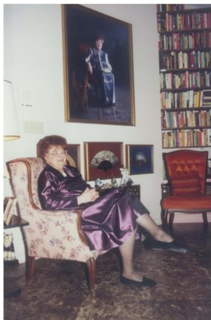
Andre Norton at Home