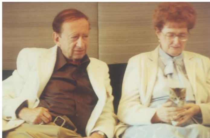
Robert Bloch, Andre Norton, and Kitten

She held several jobs in the literary field, including working for the Library of Congress during World War II. She also briefly owned a book store. Even more important to her career, she was the children's librarian for 22 years at the Cleveland Public Library, where she worked in all but two of the Library's 47 branches. During this time she wrote her own children's fiction.