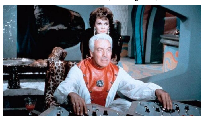
Latitude Zero 1969

A 30-minute SF series, Latitude Zero, was broadcast for 17 episodes on NBC in 1941, but only one episode has survived. The plot concerned a mysterious submarine captain, Craig Mackenzie, and his bodyguard Simba. The submarine, The Omega, was built in 1805, and MacKenzie and Simba were capable of piloting it alone. The plot involved fighting enemies of an undersea world. Lou Merrill played MacKenzie. A foreign movie based on the series was made in 1969, starring Joseph Cotten.